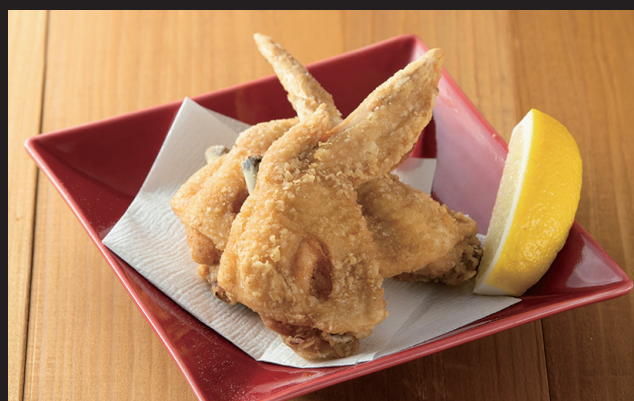
手羽先唐揚げ ¥1,320 Karaage (Chicken wings) Fried chicken wings.