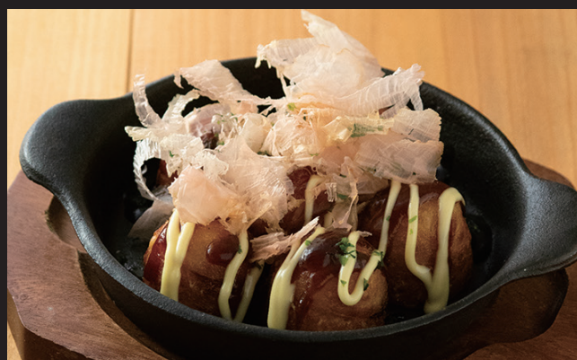
揚げたこ焼き ¥990 Takoyaki Fried takoyaki. Bonito flakes, green seaweed and mayonnaise, takoyaki sauce.