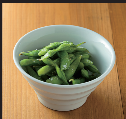
枝豆 ¥680 Edamame Boiled edamame.