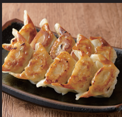
餃子 ¥780 Gyoza Original gyoza.